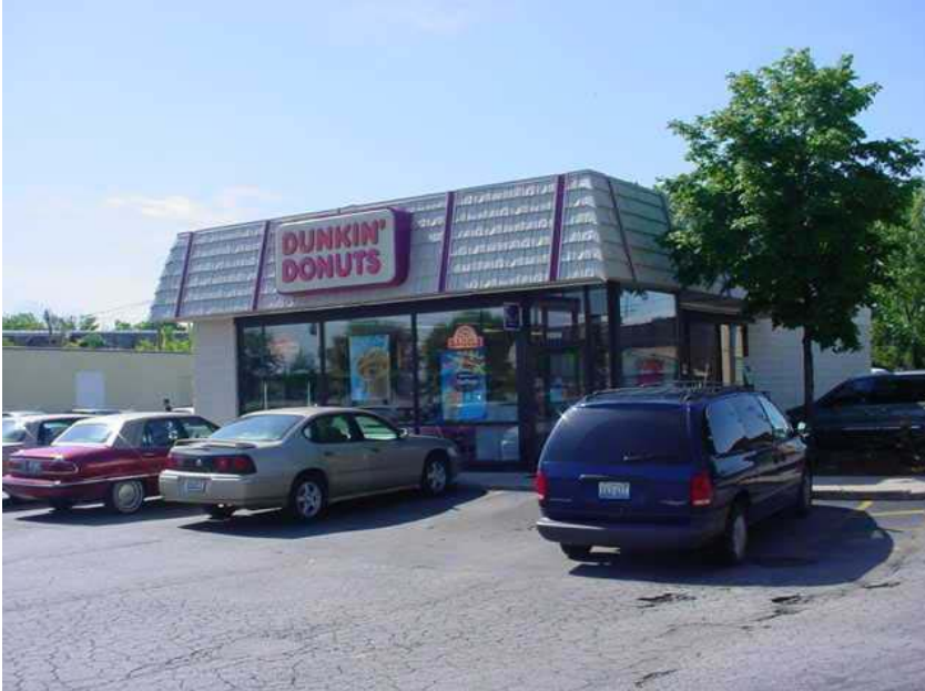
To the east of the property is 3937 Sauk Trail Road – This is a Dunkin Donuts shop. This is a joisted masonry single story structure located 30’ across a paved parking lot/drive thru area