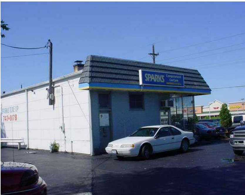
To the west of the property is 22301 Governors Highway – This is a single story joisted masonry structure used as an auto repair shop. The company is called Sparks Tune Up. This site is located 25’ across a paved parking lot.

During a cursory inspection of the adjoining properties, no neighbors were deemed as suspect relating to Recognized Environmental Conditions.