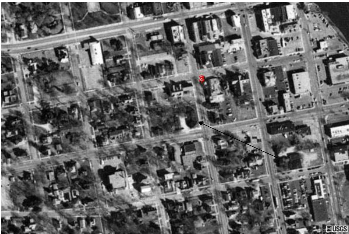
Aerial Photo of subject Property. The Property is in the middle of the picture.